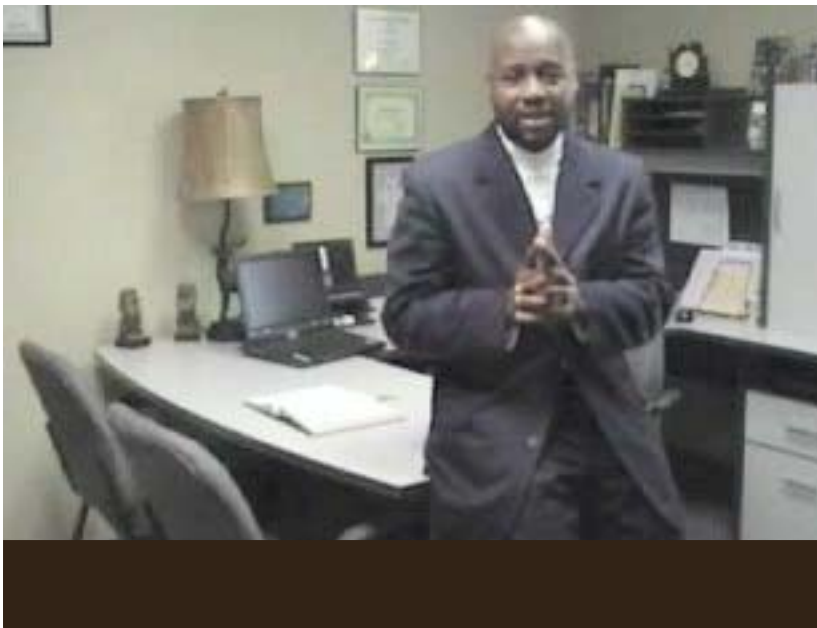
If you have Acrobat Reader 9, you can click play to view this video. If you need it, click here.

Are you living a broken life? Are you tired of just existing? Are you ready to do something more than just barely make ends meet? Our mission, is Preparing People for Heaven and Living Successful Lives. Part of our ministry is helping you learn how to (1) build and maintain a solid relationship with God through His Son, Jesus Christ, (2) receive the Holy Spirit and (3) use the gifts that He gives to those who are ready to live their lives for Christ. Many Christians go to church Sunday after Sunday, Bible study week after week, but never truly witness the awesome benefits of being a child of God the Father, a follower of Jesus, and having the Holy Spirit. That's why it is our goal to help you rise above what others consider normal everyday living, and teach you how to truly live a Christian life. To view this video message, click play, or see it on our website at www.pottershousofjc.org/tvwisdom.html and start living the way God intends you to.